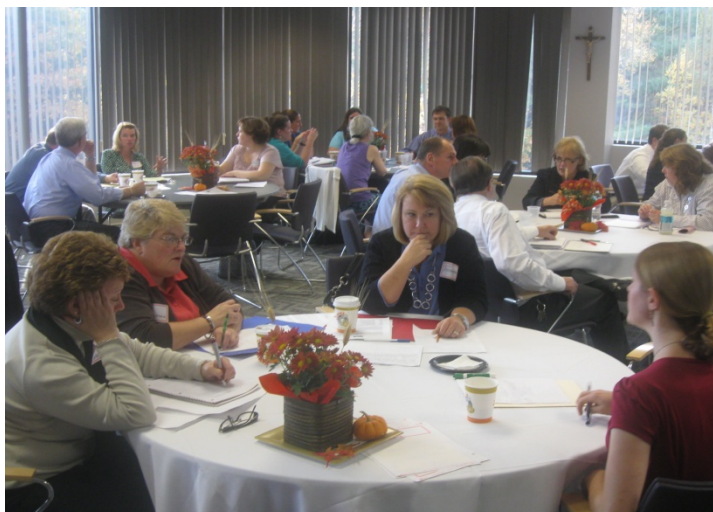
Teacher Leader Participants Discuss Potential Action Plans